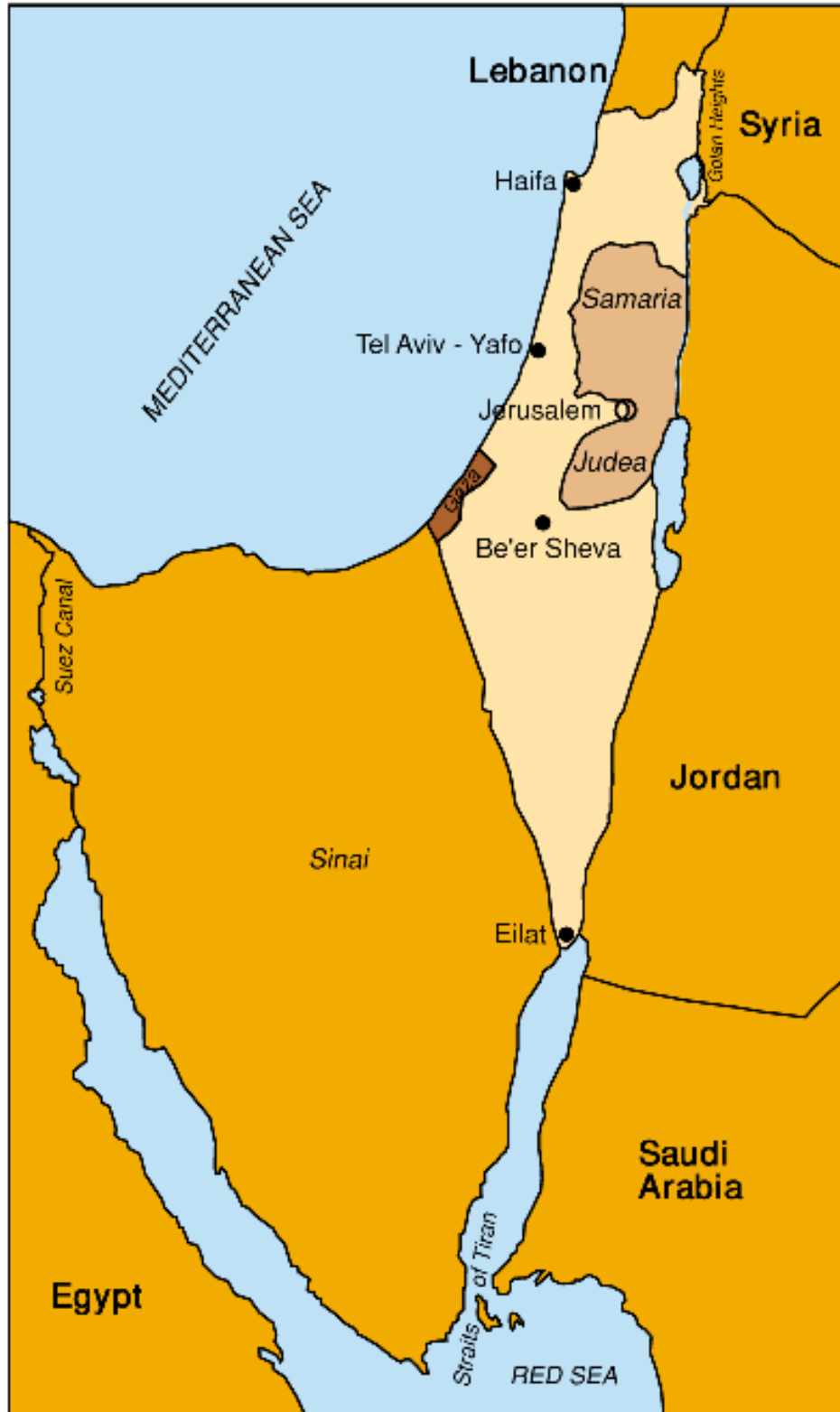
Israel before June 1967